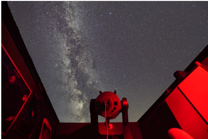
The Summer Milky Way (J.M. Dean)

A separate building with a roll-off roof houses a permanently-mounted computer-operated 16-inch Meade Schmidt-Cassegrain telescope and a 5-inch Takahashi refractor. Two additional GOTO telescopes (8" SCT and 12" Dobsonian) are also available for visual observing.