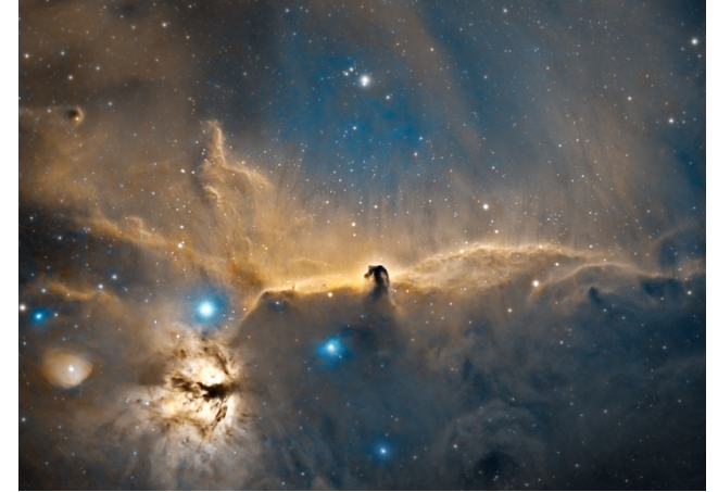
The Horsehead Nebula

Members can attend all meetings, and have access to the telescopes and other equipment, learning from the experience of other members.