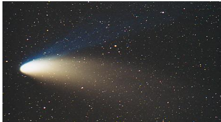
Comet Hale-Bopp (1997,)

Meetings are also held when there are special events, such as eclipses. Occasional formal lectures are held, given by members or visiting speakers; some are held at La Société's lecture theatre at Candie Gardens.